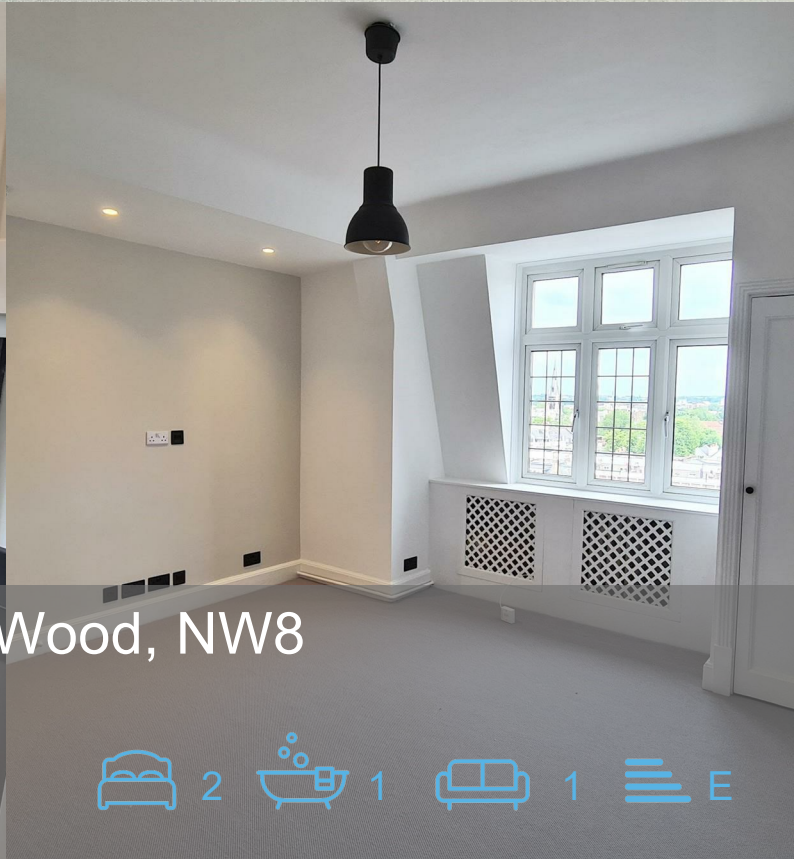
Grove Hall Court, St John's Wood, NW8